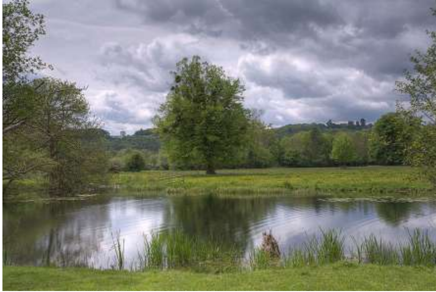
View from Magna Carta Island towards the site of the Beaumont Pitches.

Overall, the essential local character of Beaumont, where the buildings are one of the minor excitements of a relaxed and unpretentious landscape, subdue themselves to the river. The lower Thames, too tame to dominate even its tame surroundings, moves through them like an ageing and purposeless divinity, shabbily creating as it goes with all those meadows, ragged hedges, the mists and sinuous variations which are epitomised in adjoining Runnymede. Although never part of the estate, the school used those green swards of the north meads for pleasurable pastimes from the outset, and later in the 19th century for games and sports that continued till its closure. Long before Charles Barry built the Palace of Westminster, the crucible of our democracy was considered to reside in an unassuming meadow some twenty-five miles from London. If King John and his Barons had gathered there for the signing of Magna Carta, it was also the site of spirited games of football and then Rugby; the Beaumont playing fields were on the most historically important turf in these Isles.