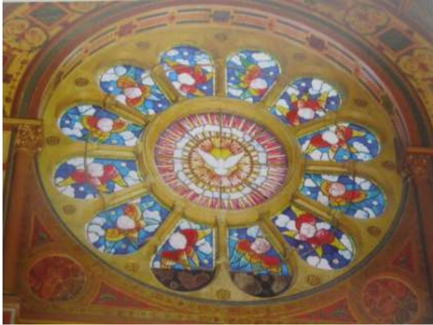
The Rose Window