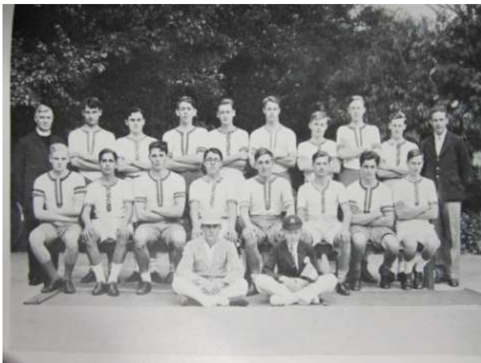
Annual joint photograph between the Wars of the Beaumont and Eton Vllls

This first royal favour brought about acceptance of the school's existence from Eton. It was said that the first challenge to a game of cricket had been met with the response "Harrow we know, Winchester we have heard of but what is Beaumont" to which the reply had been "Beaumont is what Eton was, the school for Catholic gentlemen". Whatever the truth of the matter, the two headmasters dined together and Eton became the school's oldest adversary on the playing fields and the river.