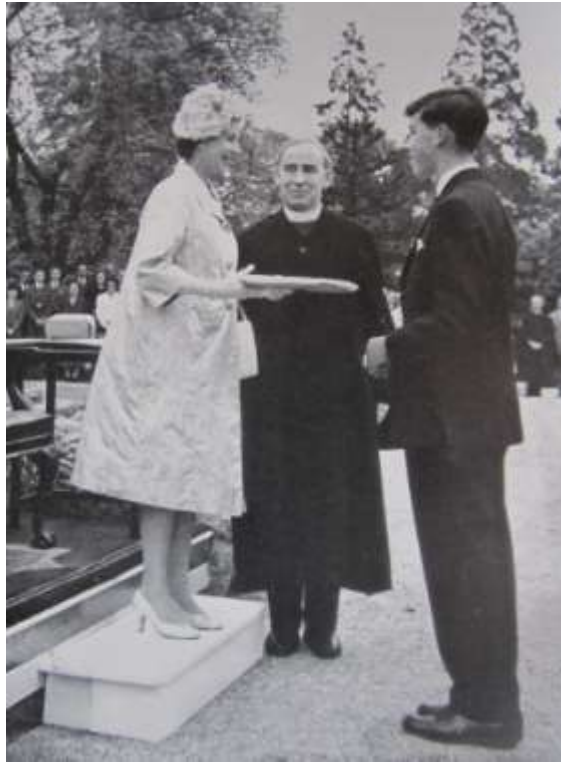
Visit of HM The Queen 1961

To mark the centenary of the school, a new accommodation block was built and was one of the last designs of Sir Giles Gilbert Scott and a larger boathouse by the architect Thomas Bedford. It was also announced that HM the Queen would visit some sixty four years after the last visit by Queen Victoria. At the end of which she was to say that “Beaumont is the most un-institutional establishment I have ever visited”.