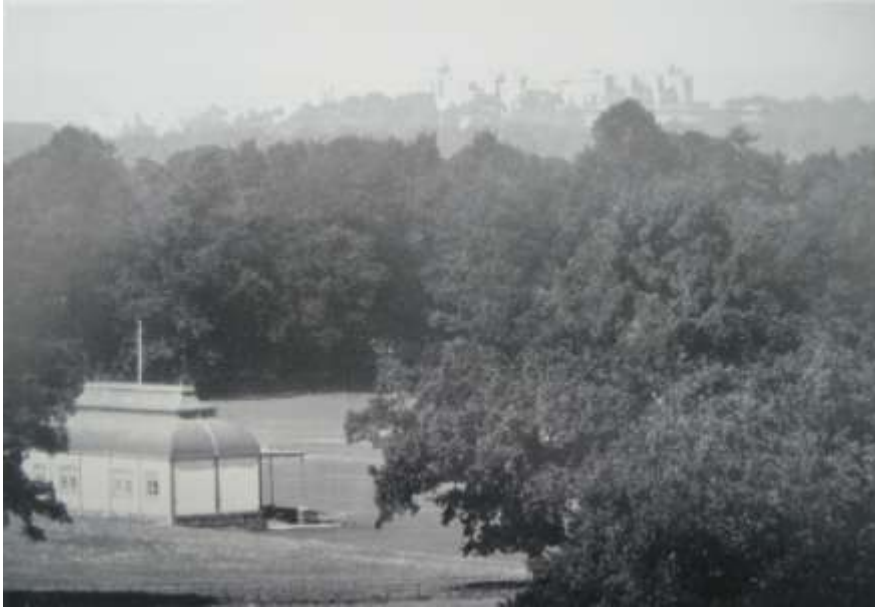
Windsor Castle from the Beeches above the Cricket Flats

This was the house chosen by the Jesuits for a noviceship near London. The Oxford movement and its results had turned the thoughts of English Catholics more towards the centres of national life from which their religion had so long cut them off. The foundation of the school was to counter those that felt the Jesuits were out of date and un-English. Stonyhurst, their establishment in the north of England, had a tremendous reputation at the time and a fine tradition of classical teaching. However, it was thought, fortress Catholicism as was the Benedictine tradition of Ampleforth and Downside. Beaumont was to answer this with a more relaxed country house approach. It was certainly going to be different from those schools that already existed, or that were being founded at the same time. The Jesuits were if anything secretive about their purchase and their intentions which some would feel, was living up to their reputation. The inspection was carried out by a priest in the disguise of a visiting gentleman. At the time, they felt that the people could accept their Order out in the wilds of Lancashire but it was another matter altogether for them to be close to London and in sight of the Royal residence at Windsor. Their concern for the anti-catholic feeling was understandable and the necessity to keep the whole affair secret, rather than risk interference from either rabble or from high political quarters.