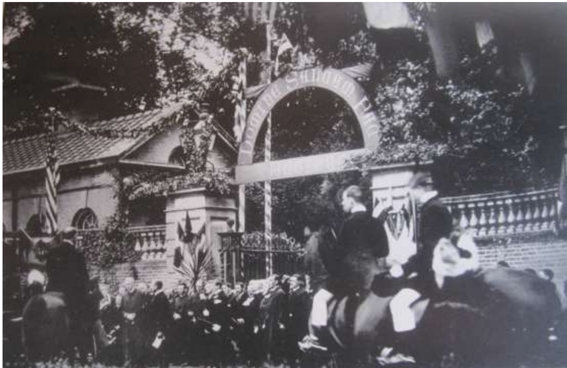
Queen Victoria arriving at the gates for her third official visit 1897