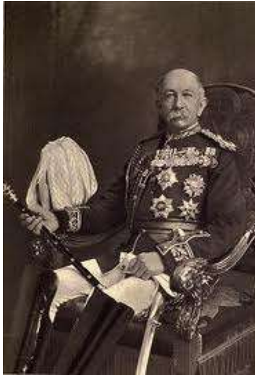
Field Marshal Sir Evelyn Wood VC