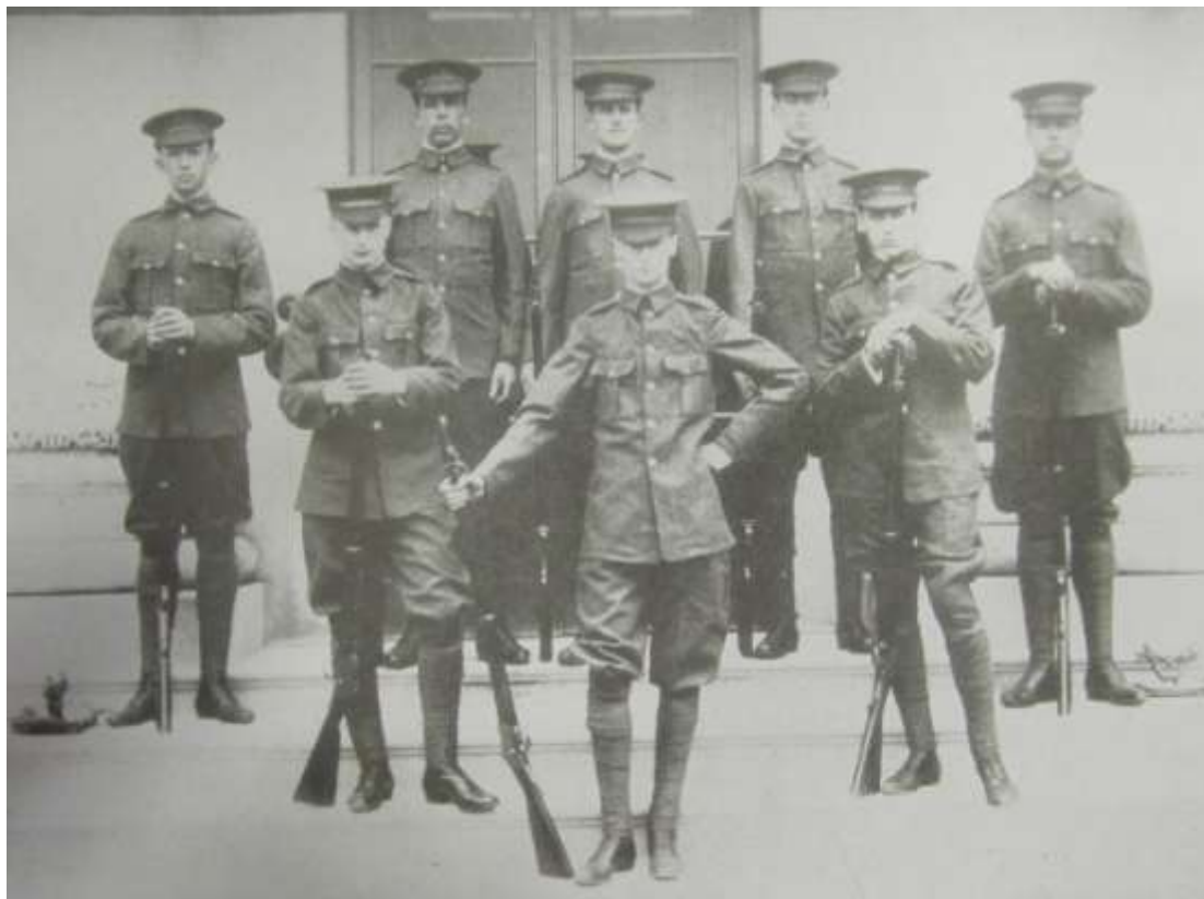
Cadets of 1905

During the school's existence there were the colonial wars of the late Victorian period culminating in the Boer War and in the 20th century - two world wars and other conflicts; the majority of Old Boys spent time in uniform. The origins of the school Corps go back to the 1870s and the Victorian ethos of that period. A group of boys took to drilling as an unofficial pastime and a drill sergeant was hired at £1 a day to come twice a week. A forerunner of the field day took place in 1879 which was recorded as "a series of sanguinary sod-fights". It was not until 1905, through the auspices of Field Marshal Sir Evelyn Wood that the Corps was made official and was affiliated to the East Surrey Regiment. They were equipped with wooden rifles; later they were issued with Lee-Enfield rifles and Martini carbines.