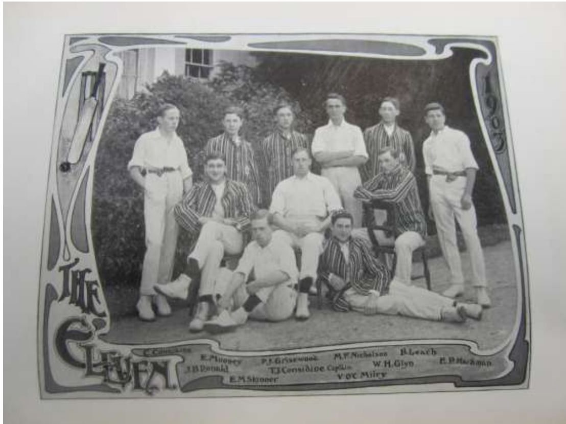
The Eleven of 1903

There was also squash, hockey, fencing from time to time and tennis though normally “with” rather than “against” female teams from nearby convent schools. Athletics, one of the oldest of activities, took place only on grass with cross-country runs to the Copper Horse in the Great Park. There was also the possibility of “water runs” when and if the Meads flooded.